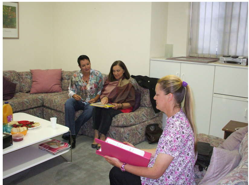
Board members at work