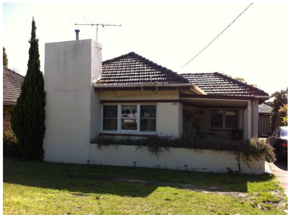
Our new premises prior to renovation

Benchmarking against Department of Child Protection Child Sexual Abuse Treatment Services (CSATS) Standards was also identified as an essential part of our quality assurance program, and this has now been completed. In addition, the agency has instituted the routine collection of feedback from all service participants, whether or not they have completed their course of counselling. This should facilitate the ongoing quality management plan.